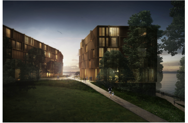
A large public park with hospitality and sailing facilities on the waterfront of the Swiss-french Lake Neuchatel.